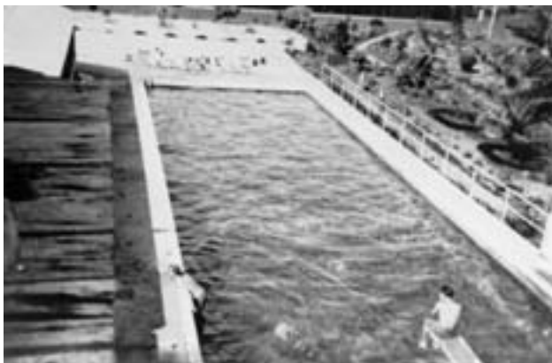
Qantas Pool, Berrimah, Darwin, 1952

TOM HUGHES, NTRS 1414, Copyprints of Darwin including old race course, 1940 - 1952