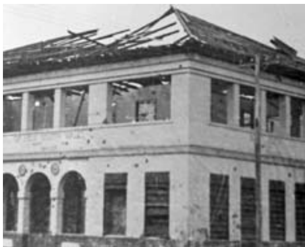
Bank of new South Wales [bomb damage], 1950

That was Tuesday the 11th of May 1954. It's hard to explain what Darwin was like then because it was still in war ruin. This was only x amount of years, seven years after the war, or roughly - you went down town there was still bombed buildings and bombed houses, and Cavenagh Street was a vacant paddock except for a few old buildings. Smith Street even had vacant paddocks. The New South Wales bank was just four