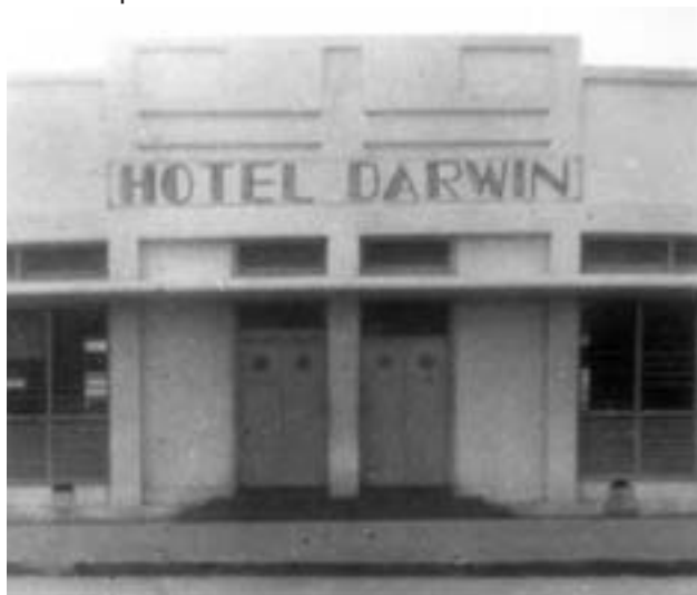
Exterior view of Hotel Darwin, 1951

What was commonly called on invitations, if they were sent out, at the bottom 'Darwin Rig'. Now Darwin Rig in those days - they dressed better in those days than they nearly do today. Although the ladies always dressed very nicely. They were always - either sent south or went to Helena's or a couple of the frock shops there and got a nice dress - ballerina or [whatever] it was in the day. But the men wore Darwin Rig, which was white pants, black shoes, white shirt and a maroon tie. Now it either had to be a straight maroon tie or a bow tie. Now that was Darwin Rig and that was quite nice in the tropics.