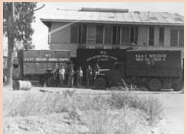
NTRS 2613/P1 - item 83 - [Eight soldiers with three trucks of the RAAF Mobile Cinema Unit], n.d.