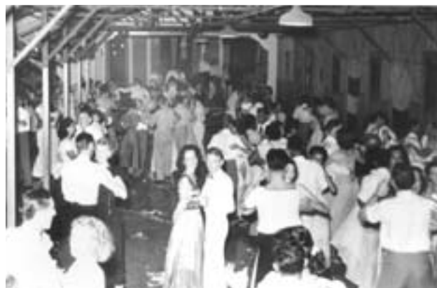
The "Catholic Palais" hall at St Mary's, Darwin, 1951