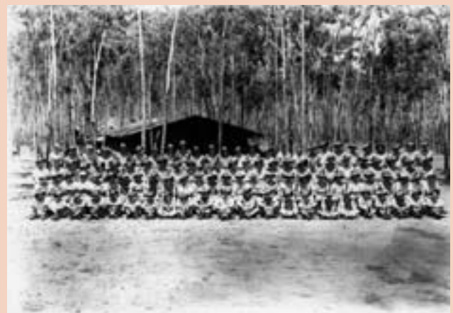
NTRS 2613/P1 - item 82 - [Group of 102 soldiers outside post office hut], n.d.