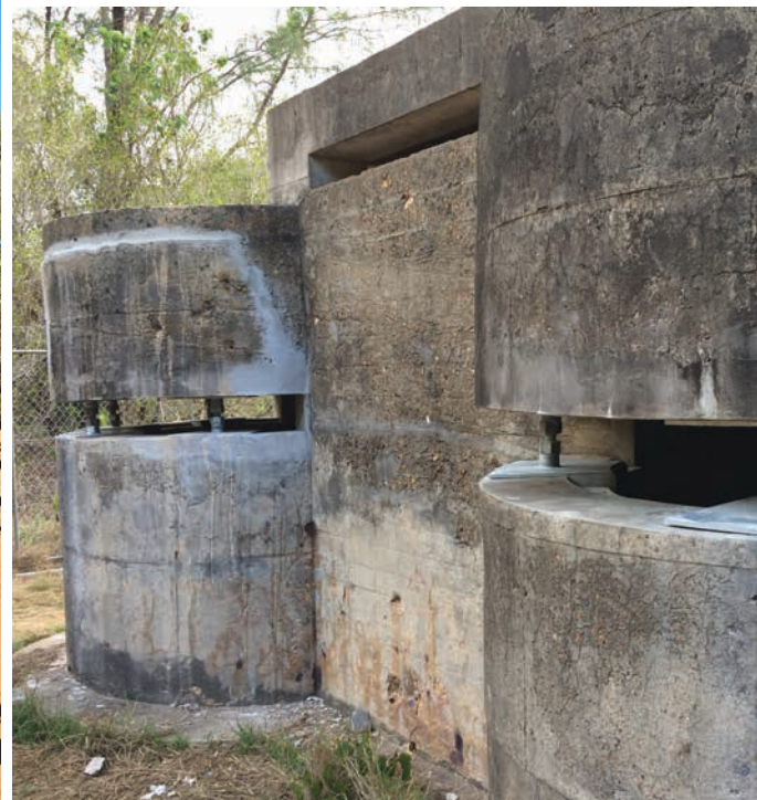
Left: The 'gallows' at the Alice Springs Telegraph Station, used for hanging slaughtered animals. Image: Heritage Branch Top Right: Palmerston Cemetery, Darwin (also known as the Goyder Road Cemetery). Image: Heritage Branch Bottom Right: WWII Observation Post, Casuarina Coastal Reserve. Image: Heritage Branch