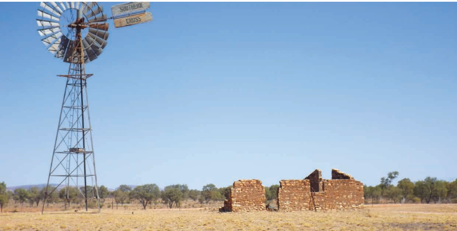
Old Stone Ruins, Hale River (Old Ambalindum).