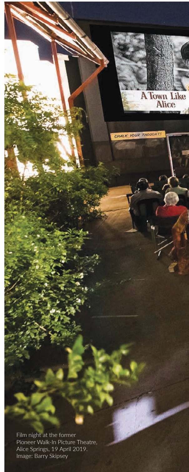
Film night at the former Pioneer Walk-In Picture Theatre, Alice Springs, 19 April 2019.

The Council worked with the Department of Tourism, Sport and Culture on the development of Terms of Reference for the Council, as part of a Departmental-wide review of Boards and Committees.