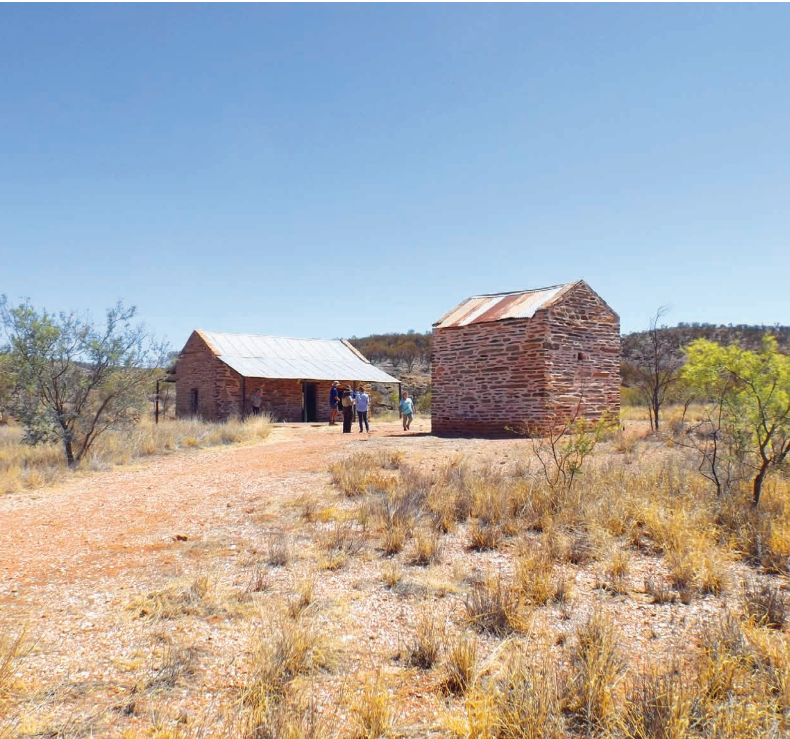
Heritage Council members at Arltunga Historical Reserve, September 2018.